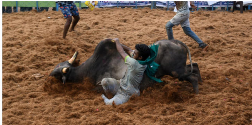
Lock of horns: A youth trying to tame a bull during a jallikattu event at Palamedu in Madurai.

The primary question involved is whether jallikattu should be granted constitutional protection as a collective cultural right under Article 29 (1) – a fundamental right guaranteed under Part III of the Constitution to protect the educational and cultural