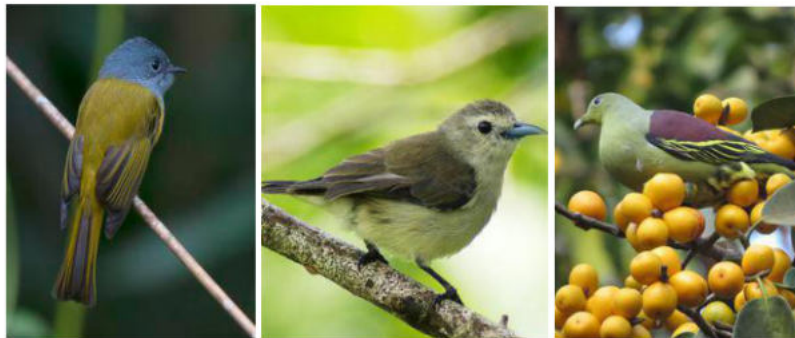
Visual treat: (from left) Grey-headed canary-flycatcher, Nilgiri flowerpecker and Pompadour green pigeon spotted in the Silent Valley National Park in Kerala.